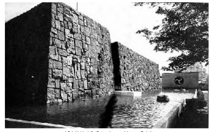
1964 World's Fair - Japan House Exhibit

We wish everyone an enjoyable summer filled with good times and good practice.